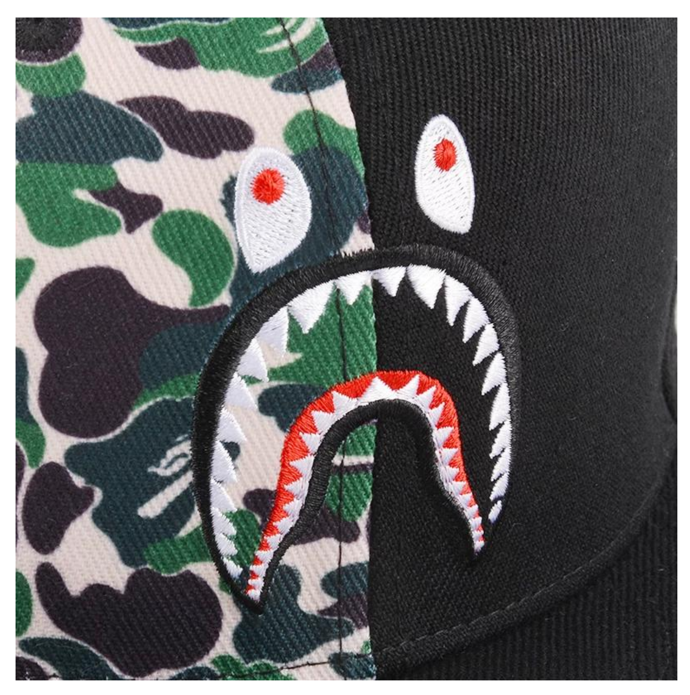
More pictures and discount, please CLICK HERE>>>