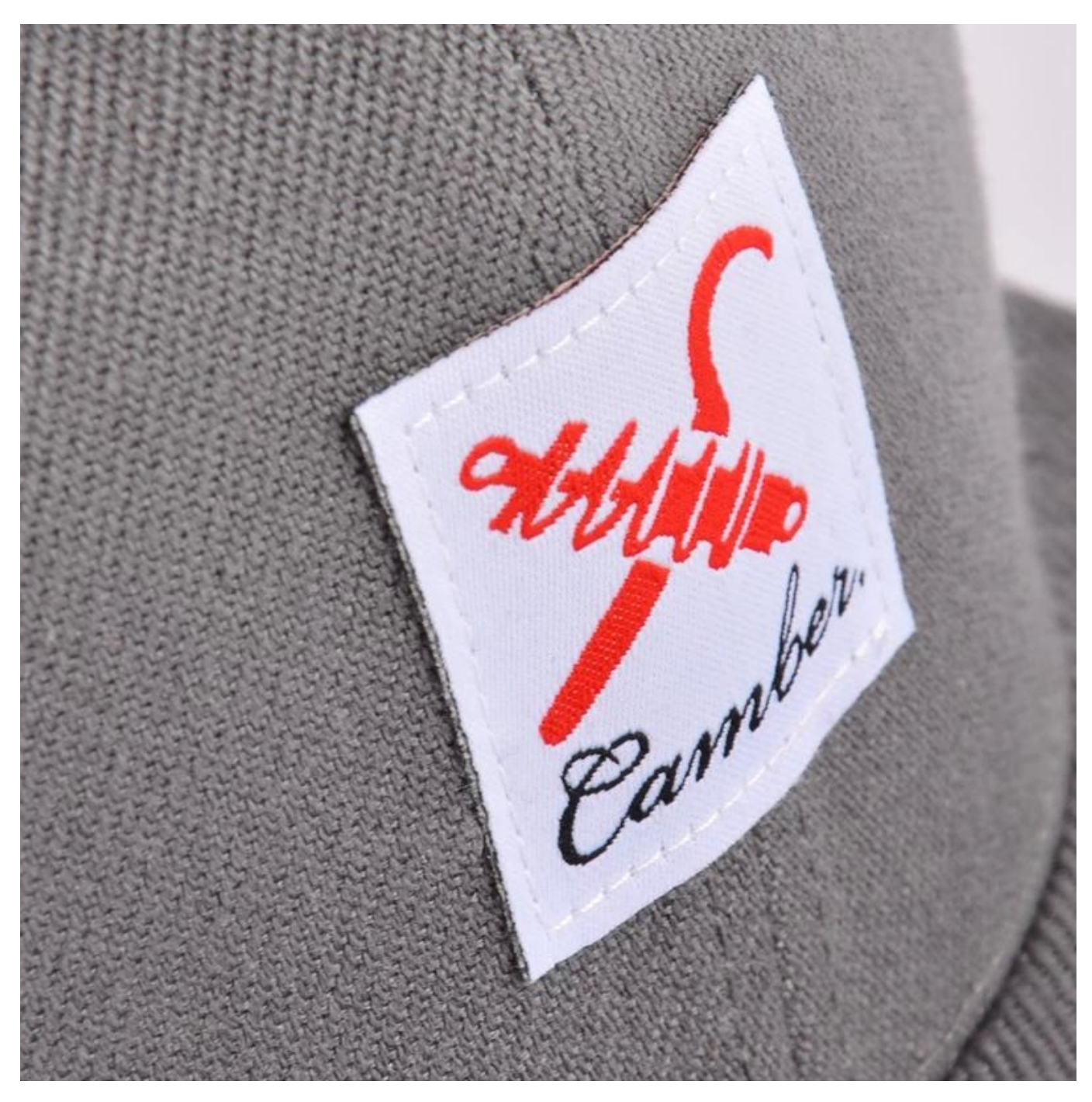
More pictures and discount, please CLICK HERE>>>