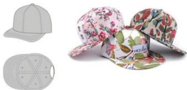
SHOWN-STRUCTURED 6PANEL | FLAT BILL ACRYLIC | LEAHTER LABEL