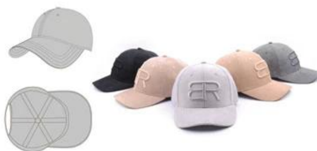
SHOWN STRUCTURED 6 PANEL FLAT BILL 100% POLYESTER 3D EMBROIDERED