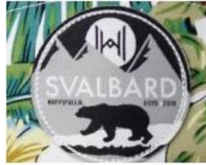
WOVEN KABEK PATCH/ PRINT LABEL PATCH