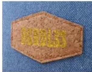
PRINT CORK PATCH