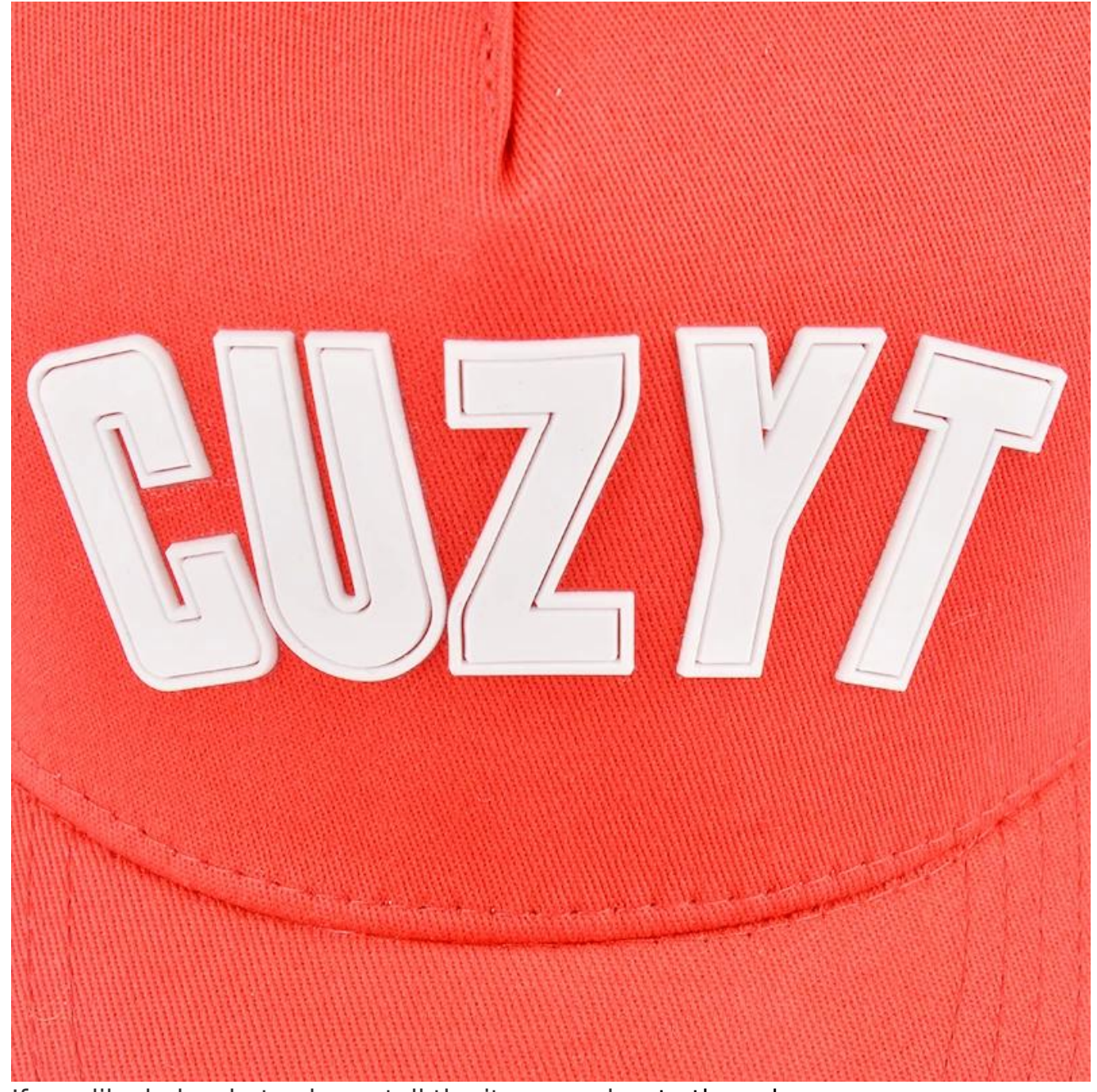
If you like below hats, please tell the item number to the salesman>>>