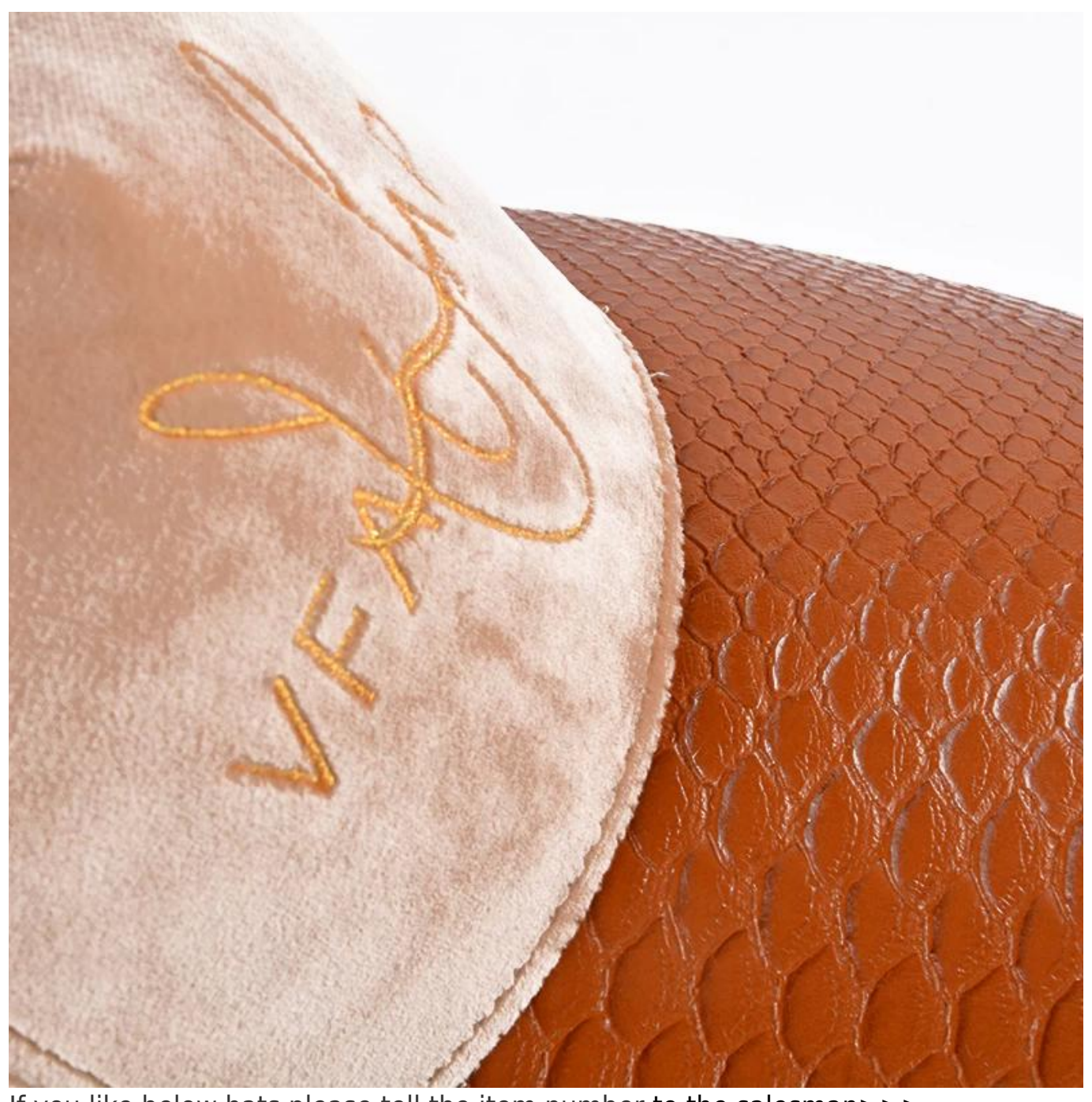
If you like below hats, please tell the item number to the salesman>>>