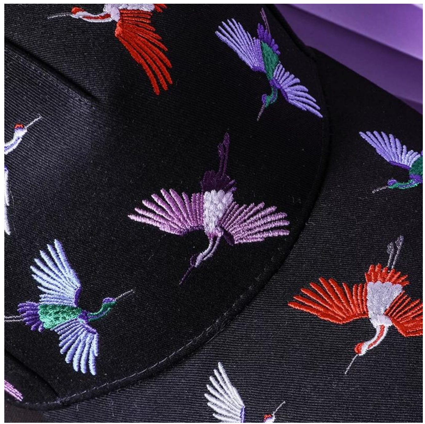
If you like below hats, please tell the item number to the salesman>>>