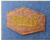
PRINT CORK PATCH