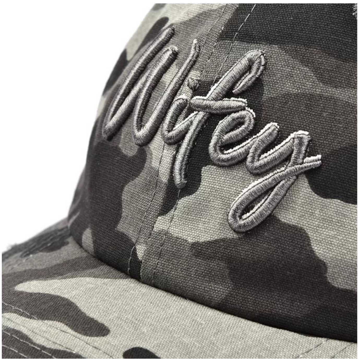
If you like below hats, please tell the item number to the salesman>>>