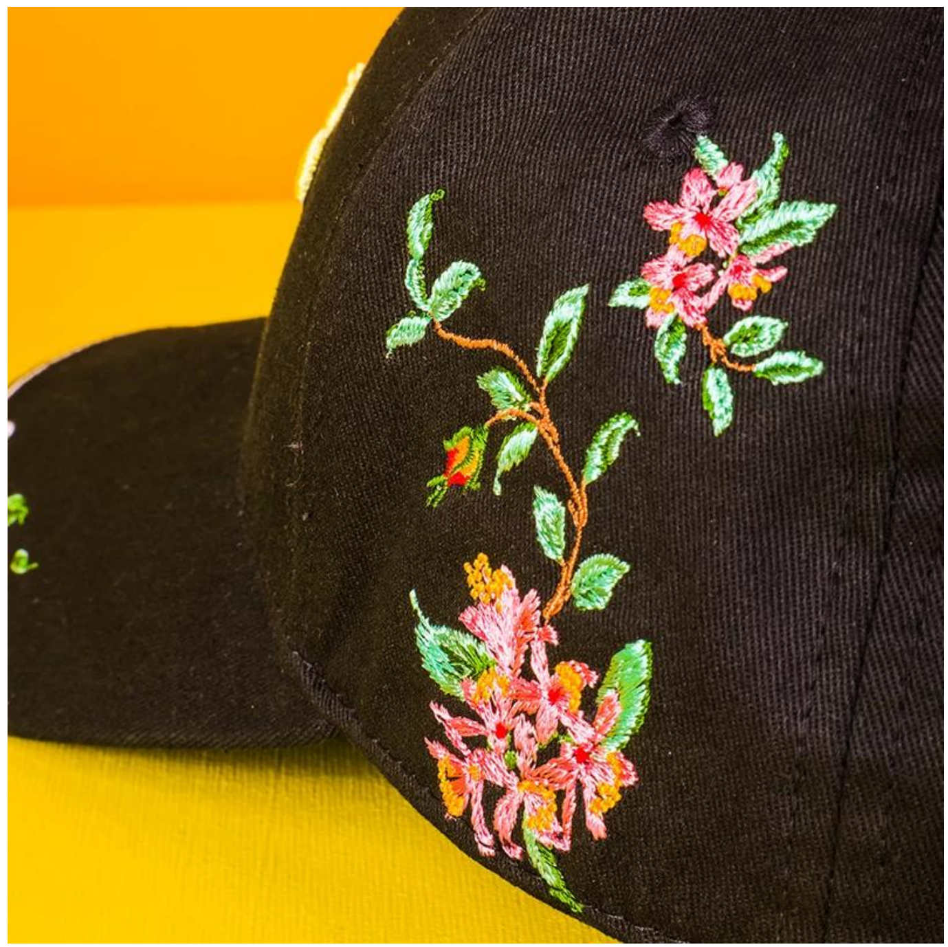
If you like below hats,please tell the item number to the salesman>>>