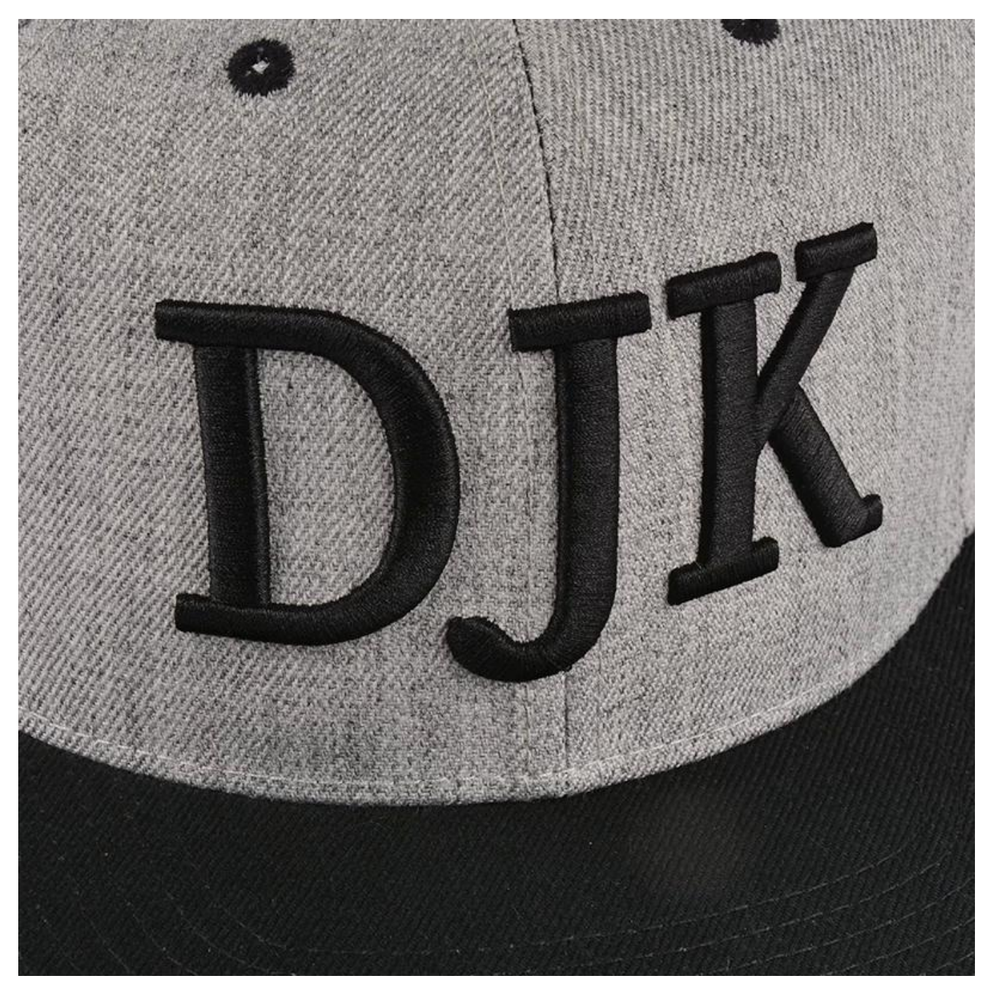
More pictures and discount, please CLICK HERE>>>