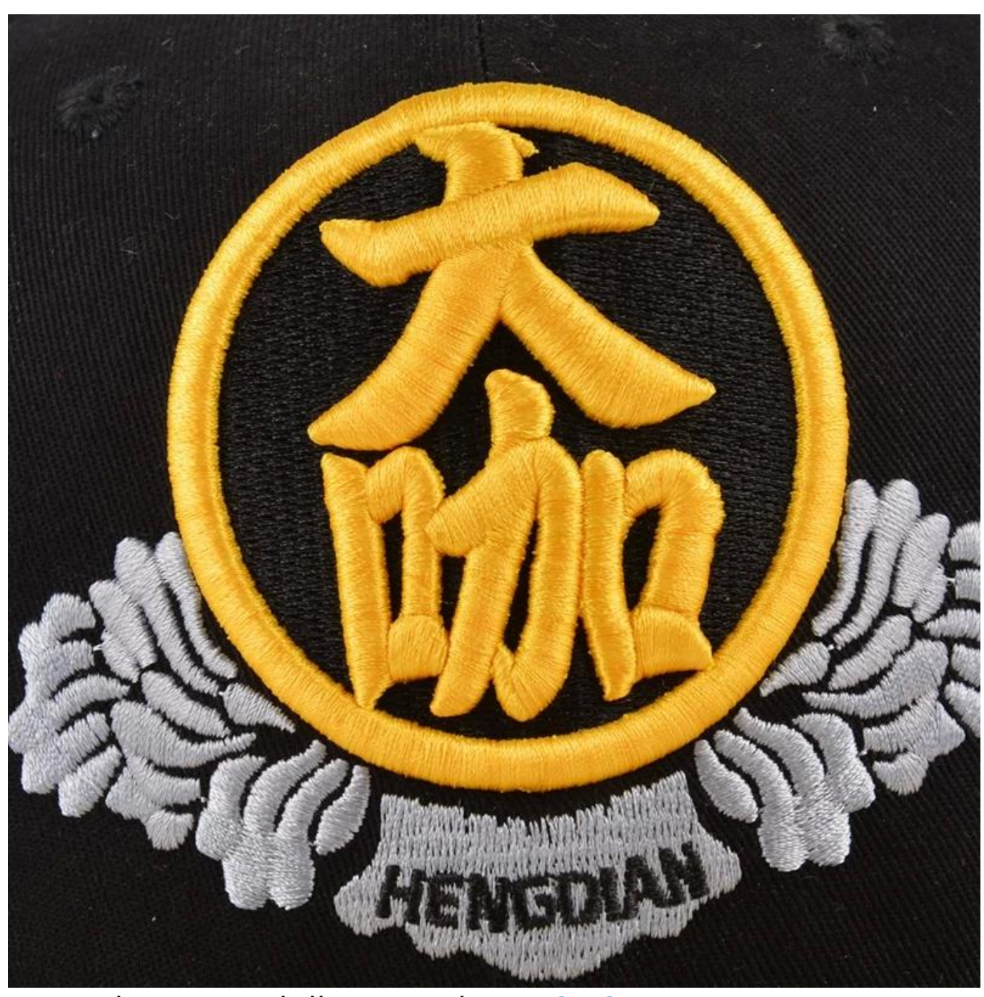
More pictures and discount, please CLICK HERE>>>