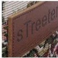
Soft Rubber Patch