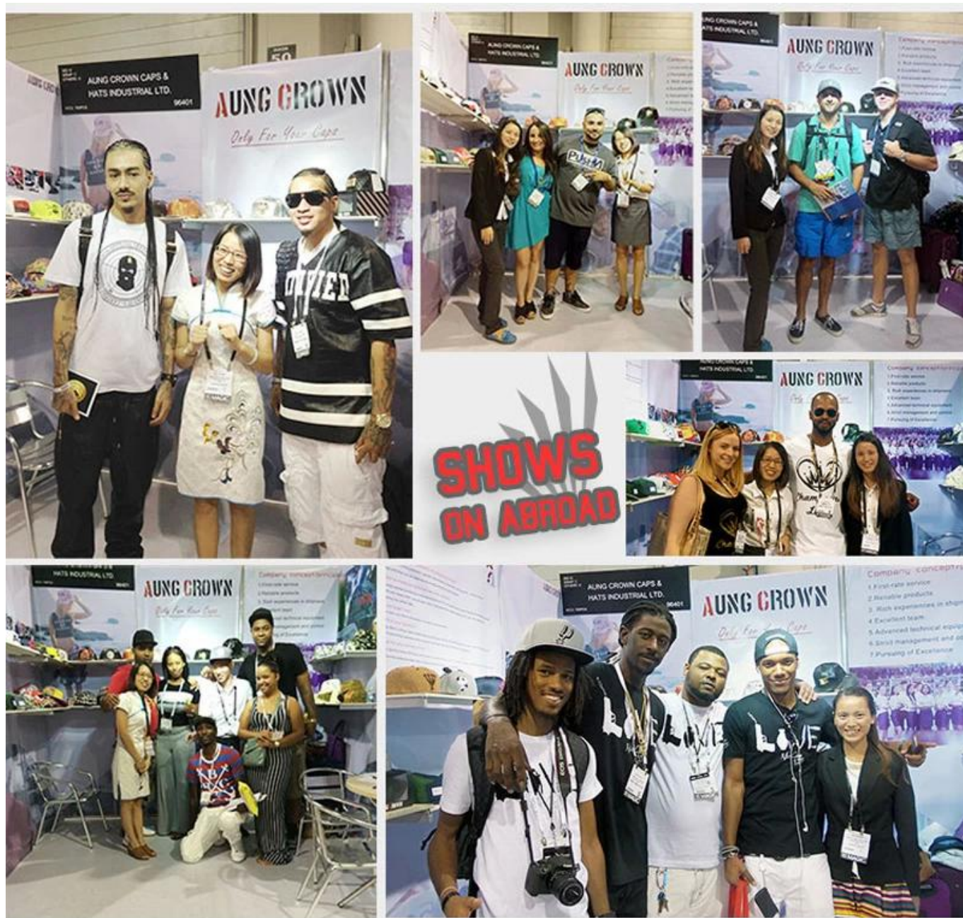
100% wool knitted beanie hat, custom beanie cap, custom flat brim caps china