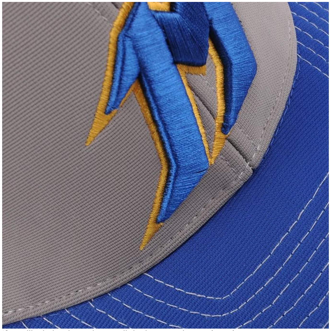
If you like below hats, please tell the item number to the salesman>>>