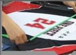
Sew and Check