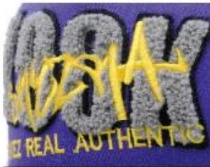
APPLIQUE WITH TOWEL