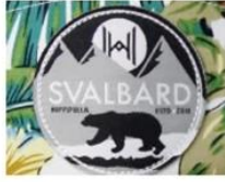
WOVEN KABEK PATCH/ PRINT LABEL PATCH