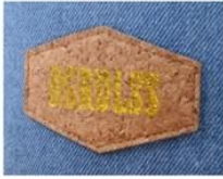
PRINT CORK PATCH