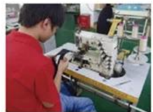
Sweatband Processing Machine