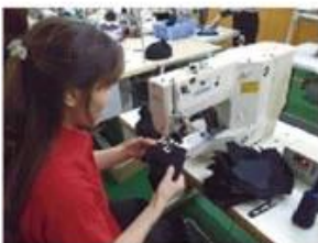
Eyelet Embroidering Machine