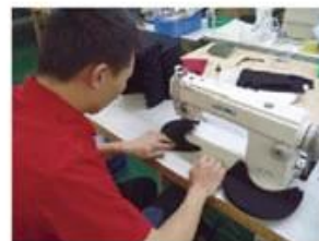
Edge Trimming Machine