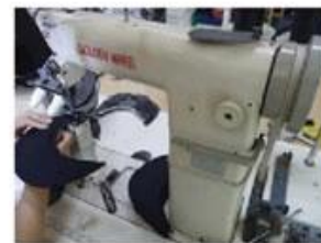
Special Streamlined Lockstitch Machine