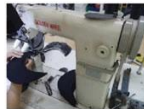
Special Streamlined Lockstitch Machine