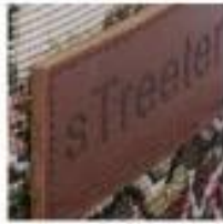
Soft Rubber Patch