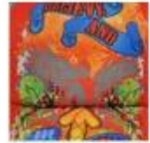
Heat Transfer Printing