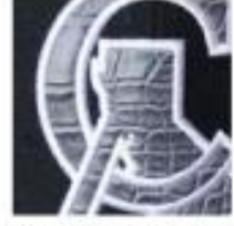
Embroidered Leather Patch