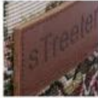
Soft Rubber Patch