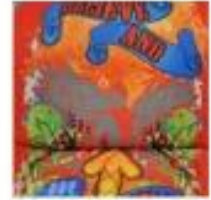
Heat Transfer Printing