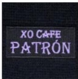
EMBROIDERED PATCH 100% EMBROIDERED PATCH | MERROWED EDGE