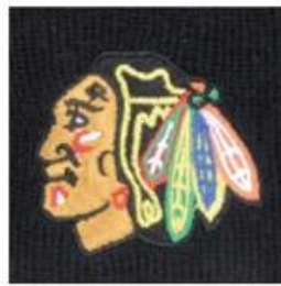
EMBROIDERY EMBROIDERED DIRECTLY ONTO FABRIC