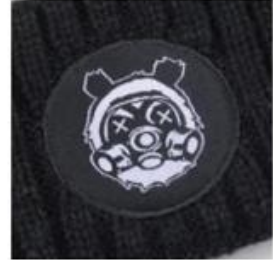
WOVEN LABEL & MERROWED EDGE HIGH DETAIL | RAISED MERROWED EDGING