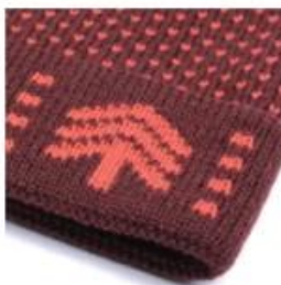
JACQUARD KNIT WOVEN TEXT OR GRAPHICS | ALLOWS FOR CREATIVITY