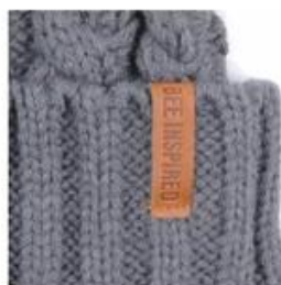
PINCH TAG WOVEN | SIZE AND SHAPE MAY VARY