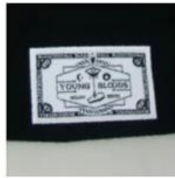
WOVEN LABEL HIGH LEVEL OF DETAIL | SEWN DIRECTLY TO FABRIC