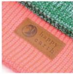
SUEDE/LEATHER FULLY STAMPED LEATHER OR SUEDE

Customize your beanie with your personal branding or artwork. Choose from any of these styles and get creative with your design.