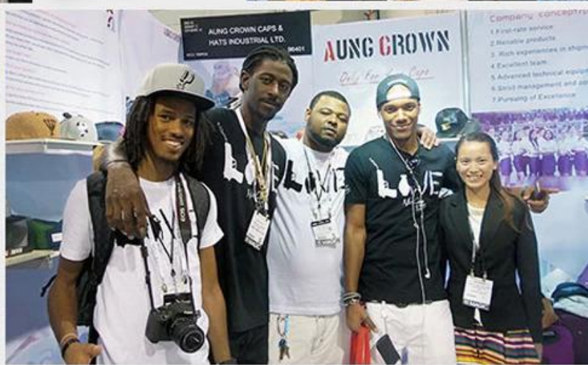
hip hop cap supplier china , floral snapback hat supplier , hip-hop snapback hats