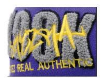
APPLIQUE WITH TOWEL