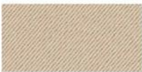
COTTON TWILL Cotton fabric woven with diagonal parallel ridges