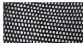
TRUCKER MESH Choose between firm or soft mesh as an option for any of the panels.