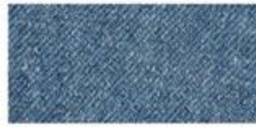
DENIM Ultra-thick cotton twill patterned fabric. Same material as blue jeans