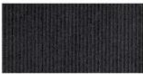
CORDUROY Thick cotton fabric with velvety ribs