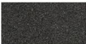
FOAM Soft porous material commonly used for sublimation or heat press.