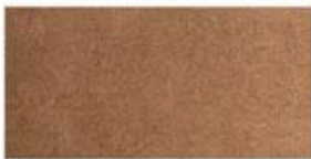
SUEDE Soft leather with a napped exterior surface