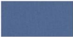
NYLON Tough lightweight synthetic fiber based fabric, durable and flexible