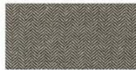
HERRINGBONE Classic wool patterned fabric. Great for any hat