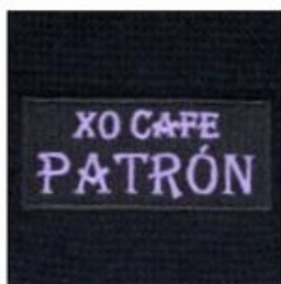
EMBROIDERED PATCH 100% EMBROIDERED PATCH | MERROWED EDGE