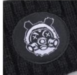
WOVEN LABEL & MERROWED EDGE HIGH DETAIL | RAISED MERROWED EDGING