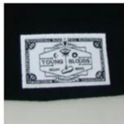
WOVEN LABEL HIGH LEVEL OF DETAIL | SEWN DIRECTLY TO FABRIC