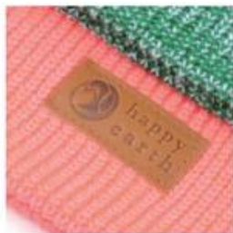
SUEDE/LEATHER FULLY STAMPED LEATHER OR SUEDE

Customize your beanie with your personal branding or artwork. Choose from any of these styles and get creative with your design.