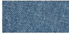
DENIM Ultra-thick cotton twill patterned fabric. Same material as blue jeans