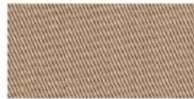
POLY-TWILL Polyester fabric woven with diagonal parallel ridges