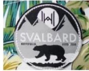
WOVEN KABEK PATCH/ PRINT LABEL PATCH