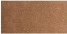
SUEDE Soft leather with a napped exterior surface