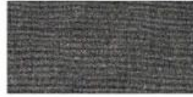
ACRYLIC Synthetic fiber based fabric. Often used for bucket hats