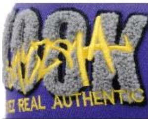
APPLIQUE WITH TOWEL