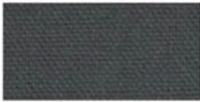
COTTON CANVAS Strong, rough, tightly woven cotton fabric