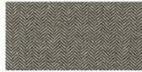
HERRINGBONE Classic wool patterned fabric. Great for any hat