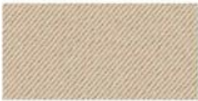
COTTON TWILL Cotton fabric woven with diagonal parallel ridges