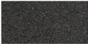
FOAM Soft porous material commonly used for sublimation or heat press.