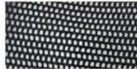
TRUCKER MESH Choose between firm or soft mesh as an option for any of the panels.