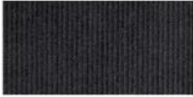
CORDUROY Thick cotton fabric with velvety ribs