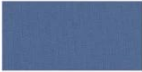
NYLON Tough lightweight synthetic fiber based fabric, durable and flexible