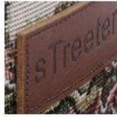
Soft Rubber Patch