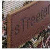
Soft Rubber Patch