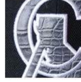
Embroidered Leather Patch