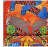
Heat Transfer Printing