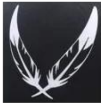
Silk screen Printing