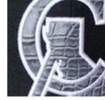
Embroidered Leather Patch