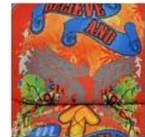
Heat Transfer Printing