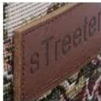
Soft Rubber Patch