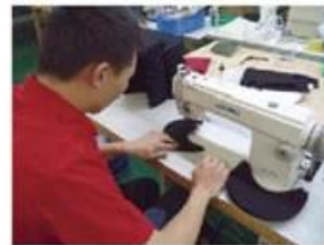
Edge Trimming Machine