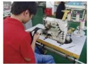
Sweatband Processing Machine