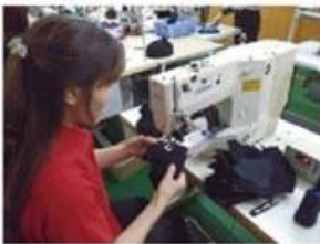
Eyelet Embroidering Machine