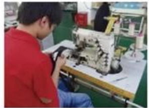
Sweatband Processing Machine