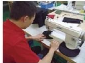
Edge Trimming Machine