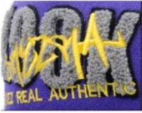
APPLIQUE WITH TOWEL