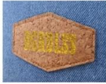
PRINT CORK PATCH