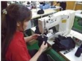
Eyelet Embroidering Machine