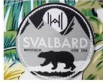
WOVEN KABEK PATCH/ PRINT LABEL PATCH