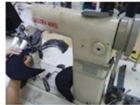
Special Streamlined Lockstitch Machine