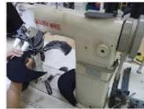
Special Streamlined Lockstitch Machine