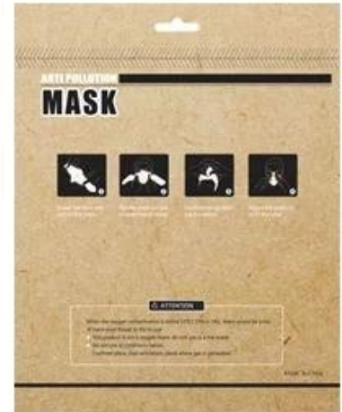
Kraft paper bag(No.3)