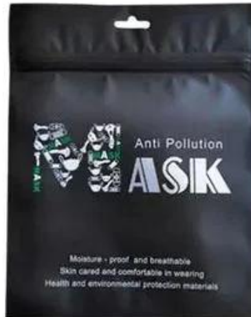
Black print bag(No.2)