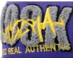
APPLIQUE WITH TOWEL