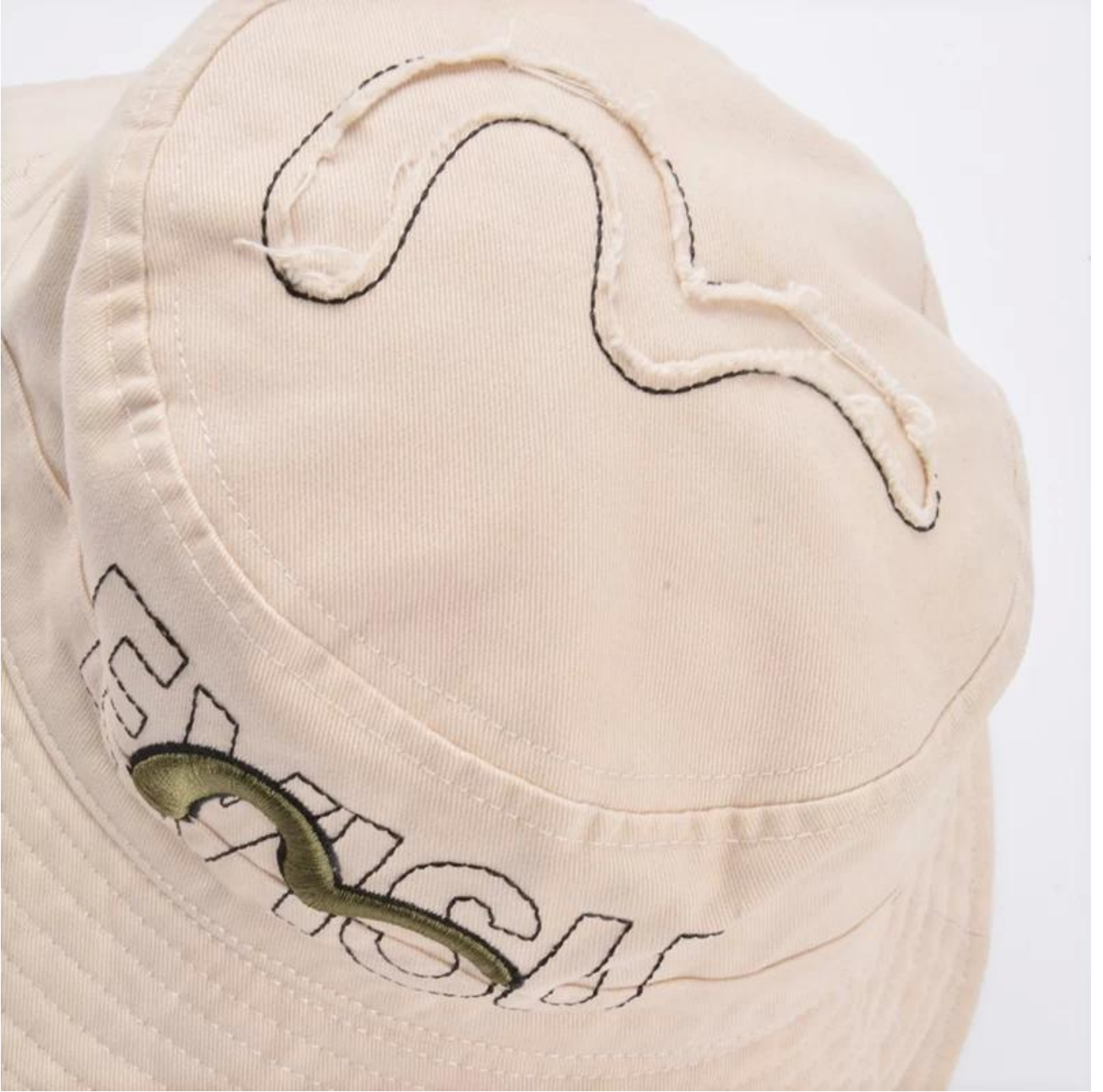
بوكه أخرى تي قبعة النماذج التي قد ترغب