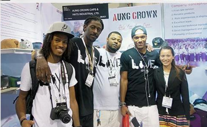
plain snapback hat china custom flat bill snapback cap, american flat peak cap