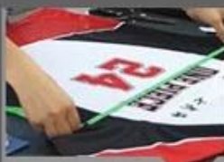
Sew and Check