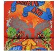
Heat Transfer Printing