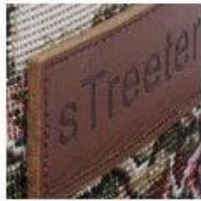
Soft Rubber Patch