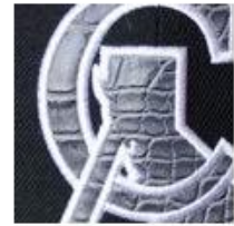
Embroidered Leather Patch