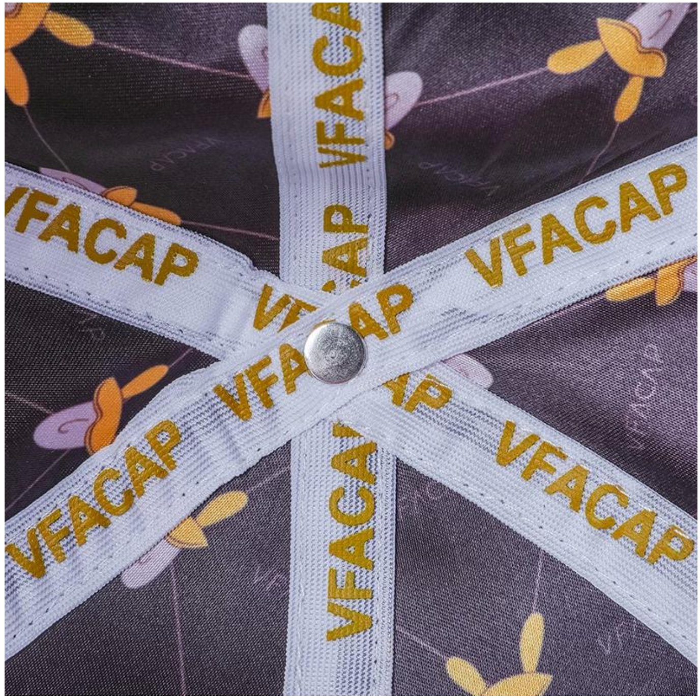
If you like below hats, please tell the item number to the salesman>>>