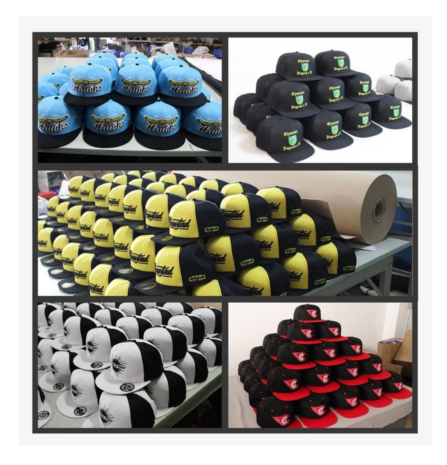
If you want to know more or have any questions feel free to contact us