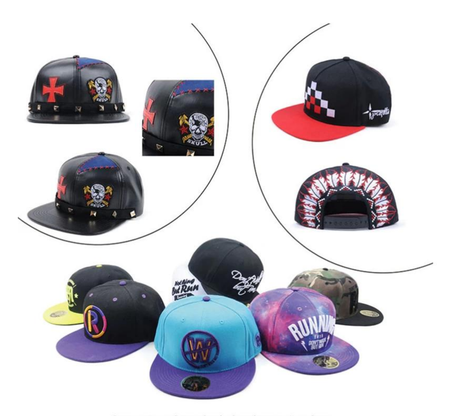
Create your own Custom Snapbacks and more at Aung Crown.