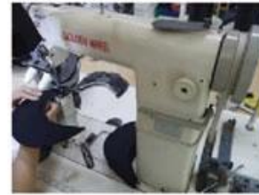
Special Streamlined Lockstitch Machine