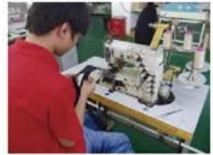
Sweatband Processing Machine