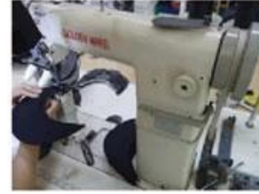
Special Streamlined Lockstitch Machine