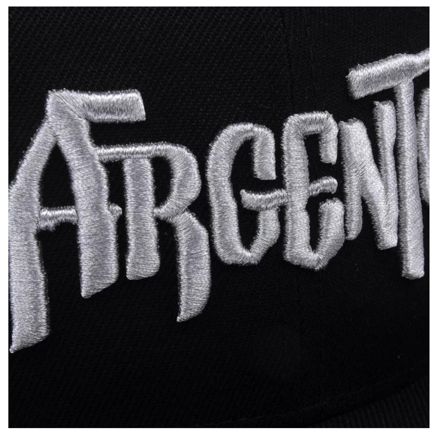
Other snapback cap(new design acrylic snapback caps) models you may like