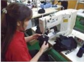
Eyelet Embroidering Machine