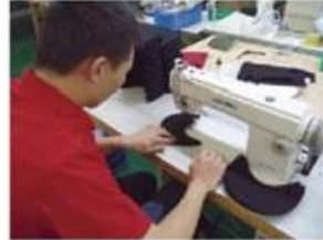
Edge Trimming Machine