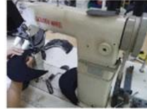
Special Streamlined Lockstitch Machine