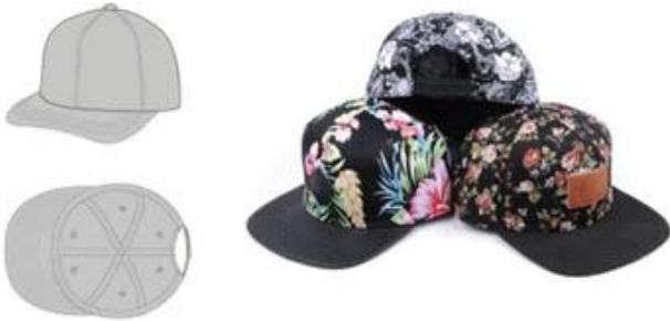
SHOWN STRUCTURED 6 PANEL FLAT BILL 100% POLYESTER 3D EMBROIDERED