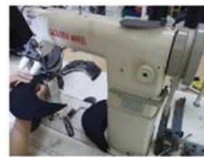
Special Streamlined Lockstitch Machine